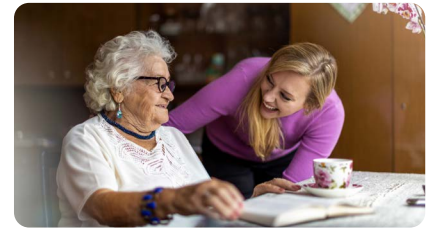
Prevention of hospital admission