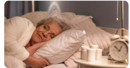
Waking / Sleep-in nights